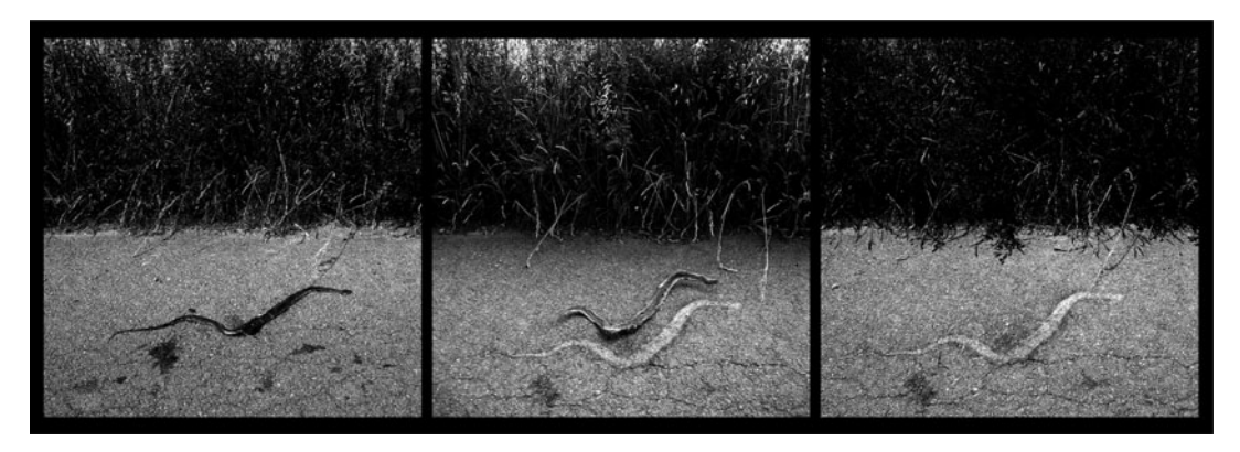
Figure 1. One of Manel Esclusa's responses to a triptych sent by Marcelo Brodsky as part of Visual Correspondences/Correspondencias visuals : Manel Esclusa–Marcelo Brodsky, 2006–10.

Brodsky's Visual Correspondences was one inspiration for a three-year research project by Eduardo Cadava and Gabriela Nouzeilles called ltinerant Languages of Photography , involving international conferences and workshops, culminating in an exhibition and book. Against the vague and contested post-war notion of photography as a "universal language," the project conceived of photography as a transnational practice of circulation and citation, or "itinerant languages," in which photographs are constantly recontextualized as they travel around the world. But as Cadava also notes, it is "photography's universally (yet variably) perceived 'self-